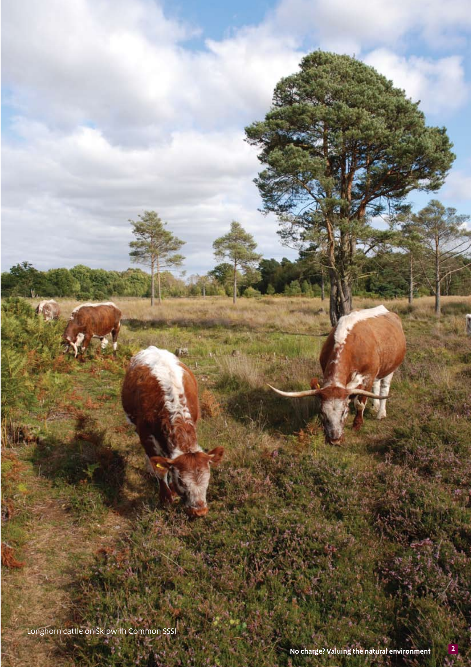
Longhorn cattle on Skipwith Common SSSI