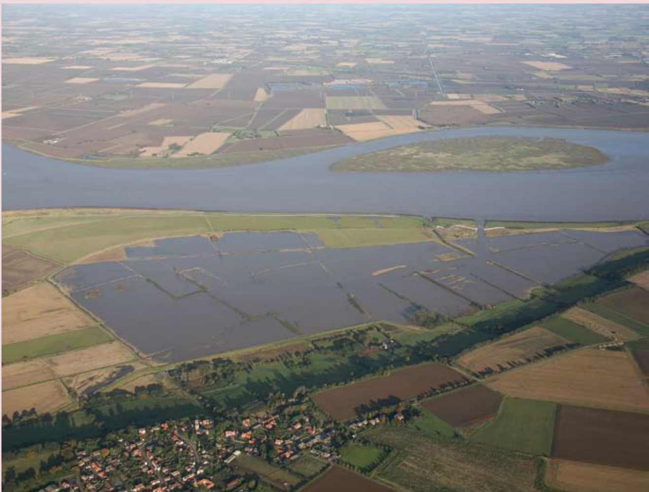
Alkborough Flats inundated following a breach in the flood defence bank