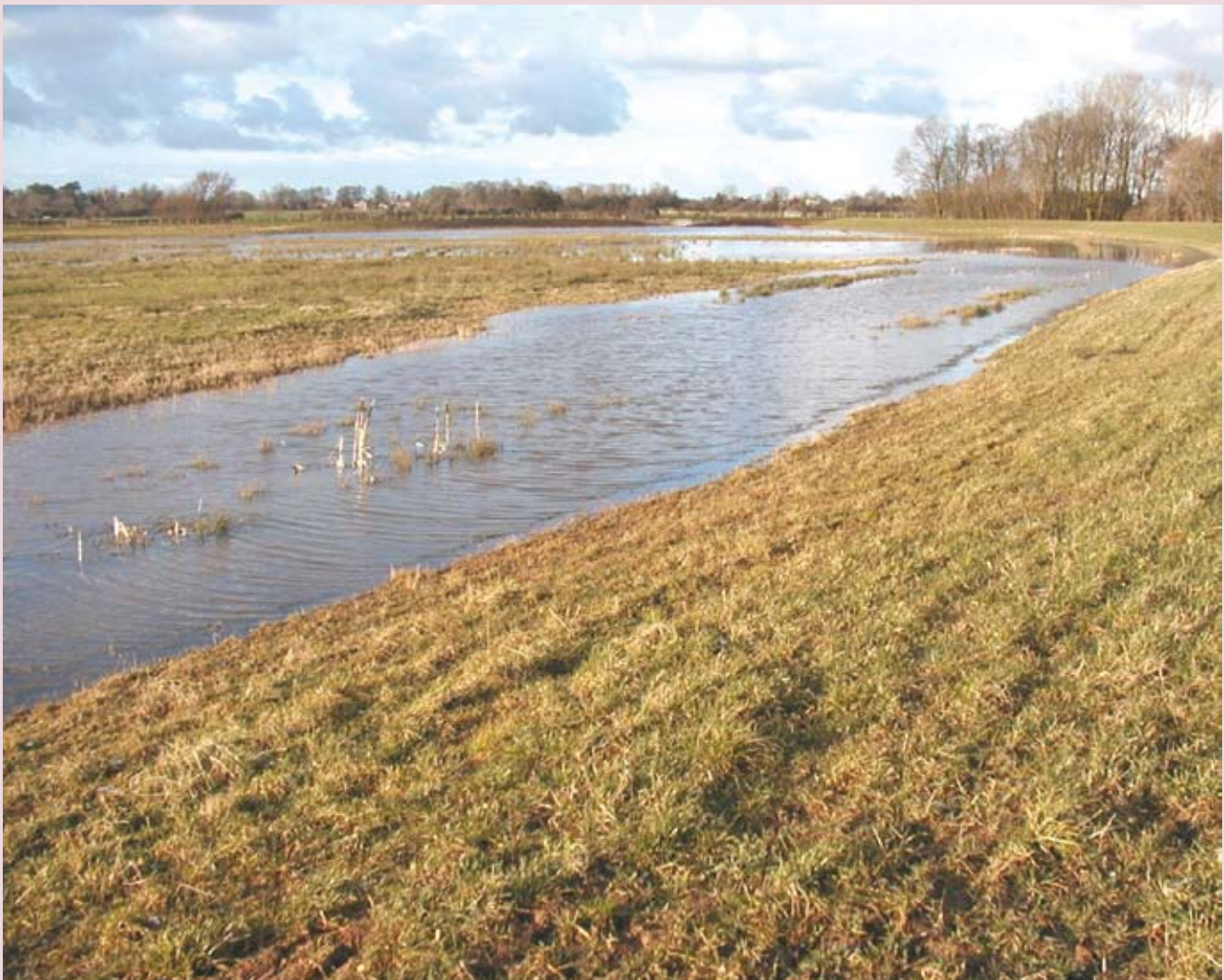
Washlands in Lincolnshire