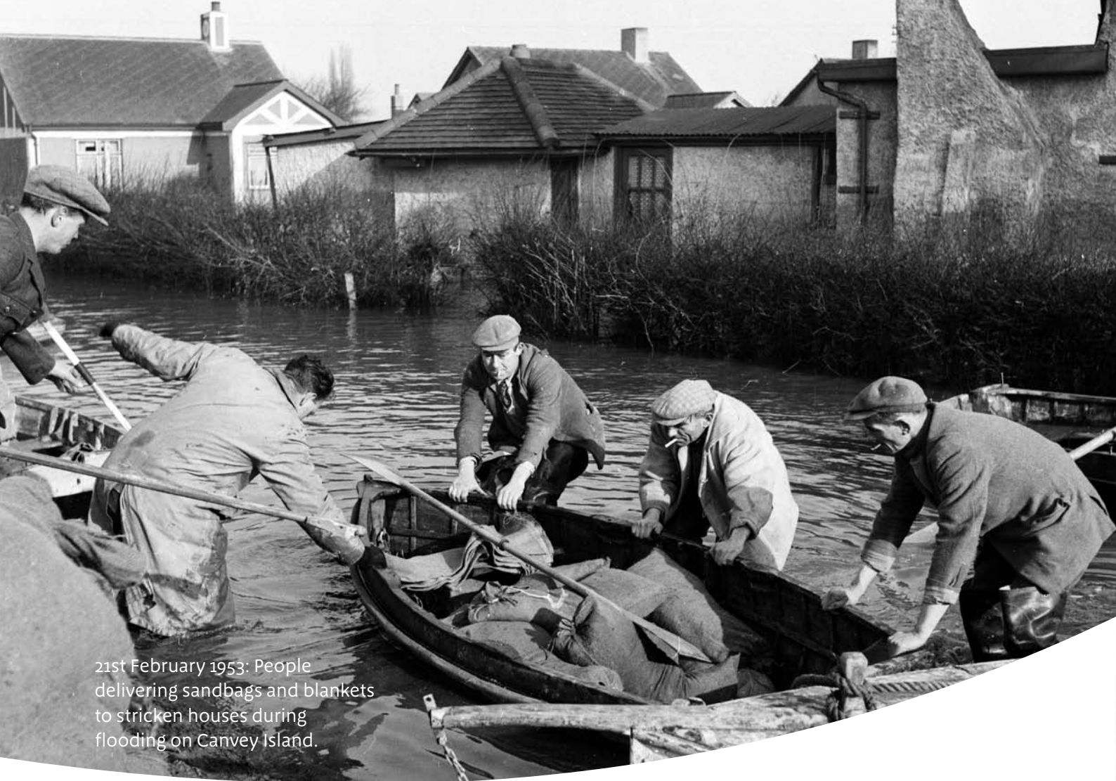
21st February 1953: People delivering sandbags and blankets to stricken houses during flooding on Canvey Island.