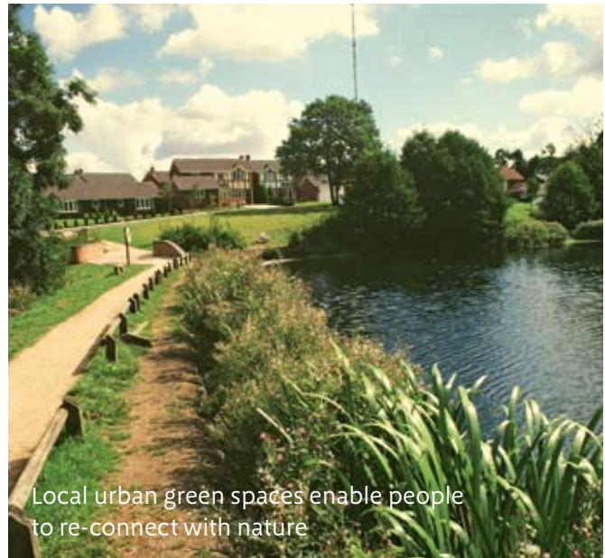
Local urban green spaces enable people to re-connect with nature

There is considerable scope to broaden the use of market-based approaches in England (CLA, 2009). 'Biodiversity offsetting', where residual impacts of development on biodiversity are offset through investments in habitat restoration and creation elsewhere, has significant potential for further development. Currently, offsetting is required and practiced under the EU Habitats Directive in order to maintain the integrity of the Natura 2000 network but there is significant potential to extend its coverage to tackle biodiversity losses outside of protected areas. Clearly there are opportunities and risks associated with