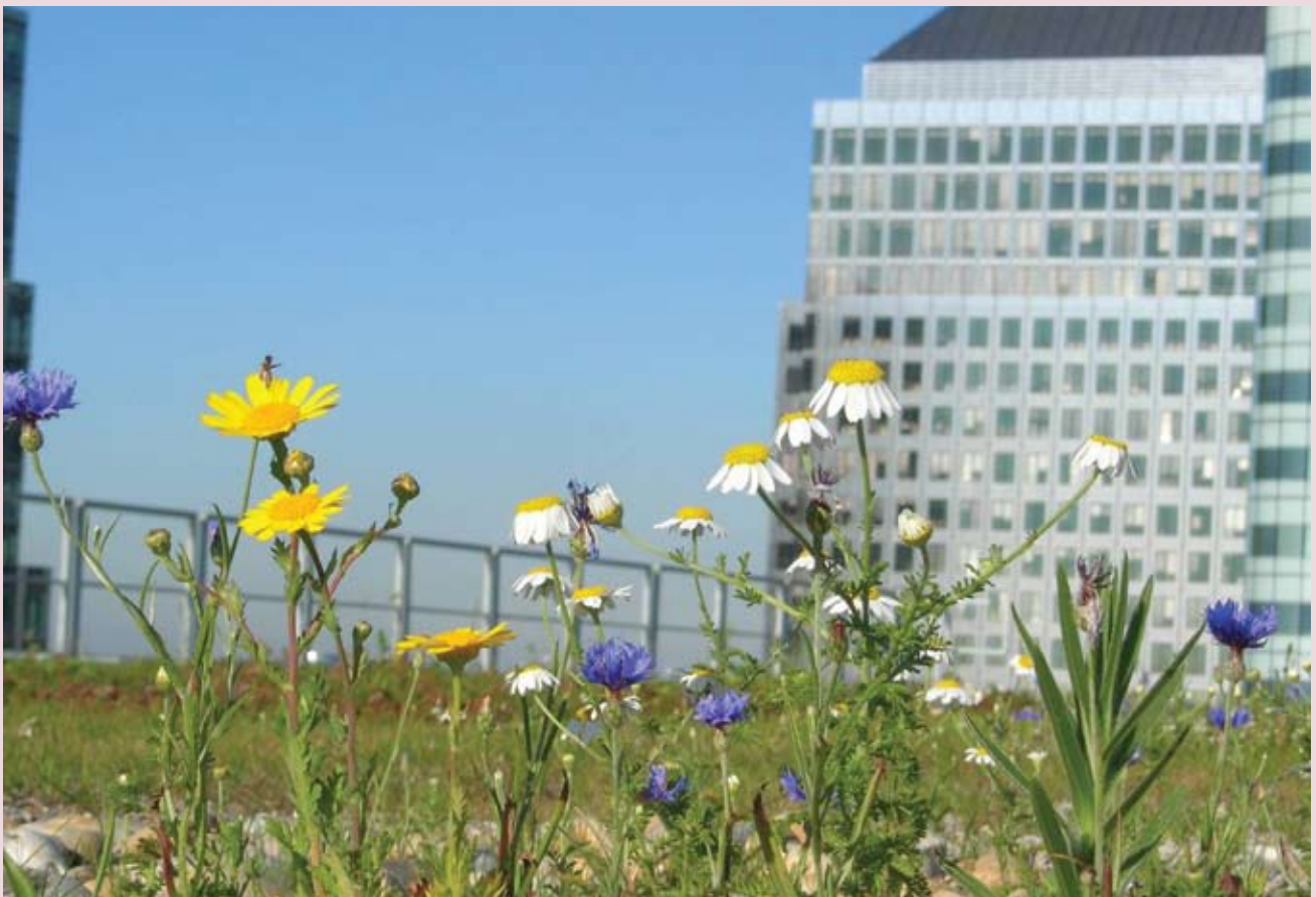
Green roof on Barclays Bank, Canary Wharf, London