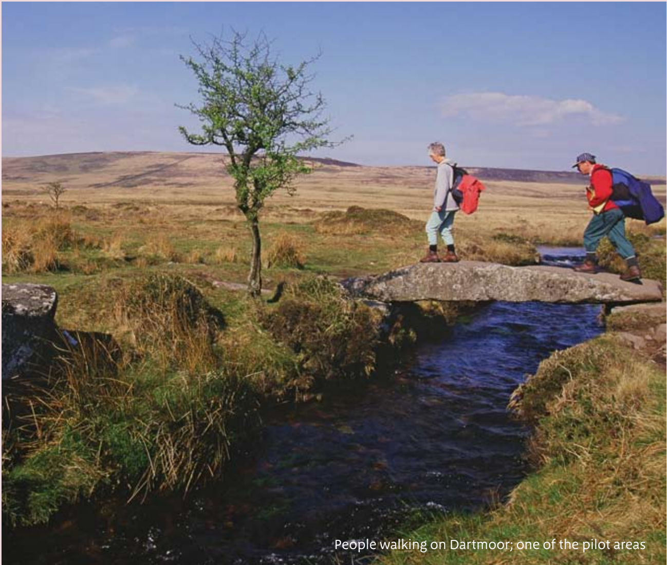
People walking on Dartmoor; one of the pilot areas