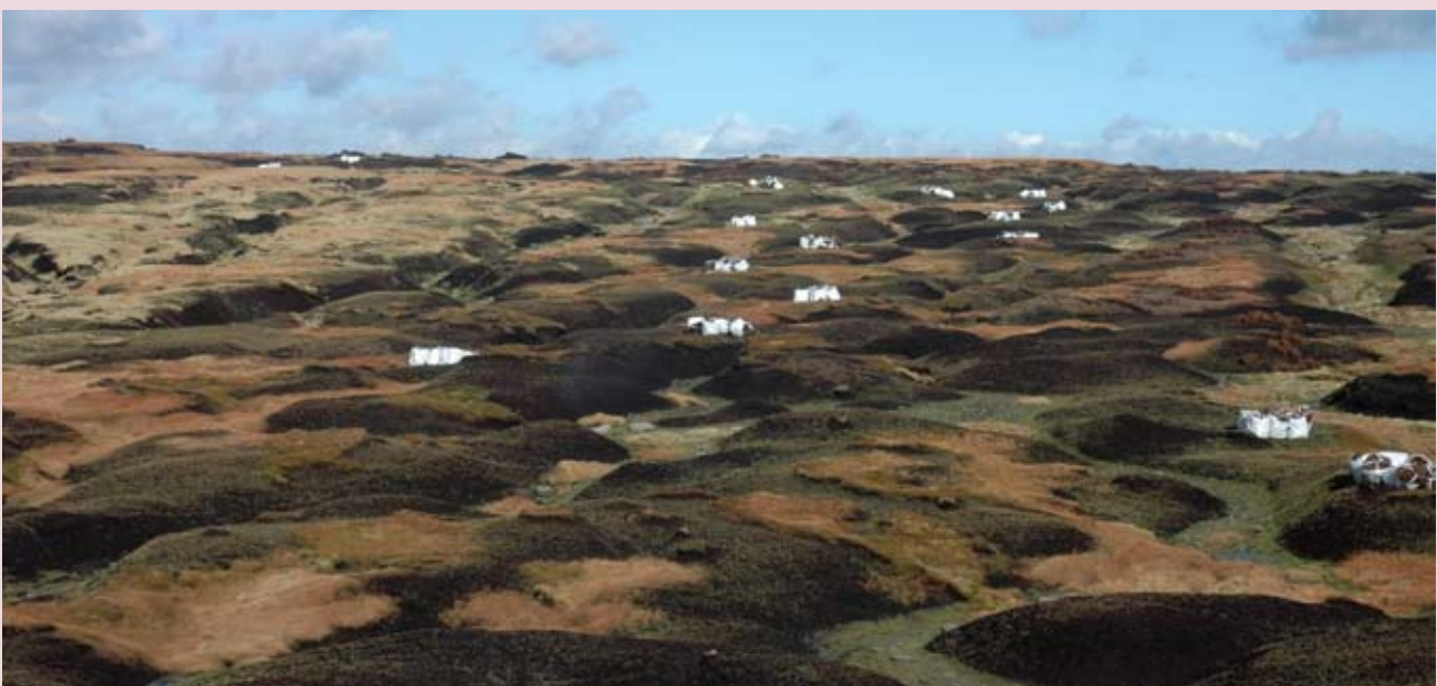
On-going restoration of Bleaklow using heather brash laying techniques