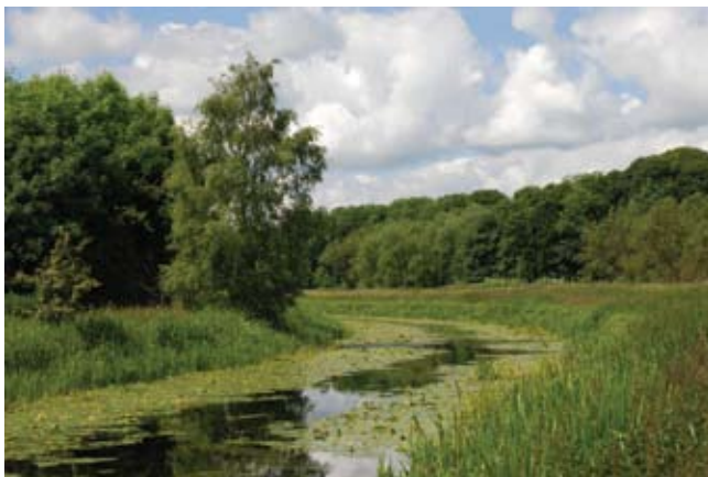
Pocklington Canal SSSI – popular for recreation and important for wildlife