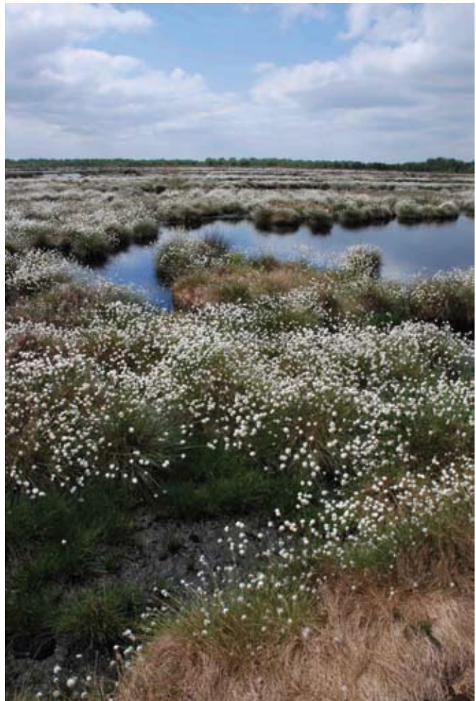
Thorne Moors; Thorne, Crowle and Goole Moors SSSI – a lowland raised bog providing carbon storage, water regulation, recreation and conserving biodiversity

CAP may next change significantly in 2014, when the new EU 'multi-annual financial framework' comes into operation and existing Rural Development Programmes come to an end. As part of this next reform, Natural England believes there is a need for a large-scale transfer of funds from income support to support for sustainable rural development. This includes securing environmental goods and services, such as climate change adaptation and mitigation, which would not otherwise be provided by markets but are nevertheless essential for future wellbeing.