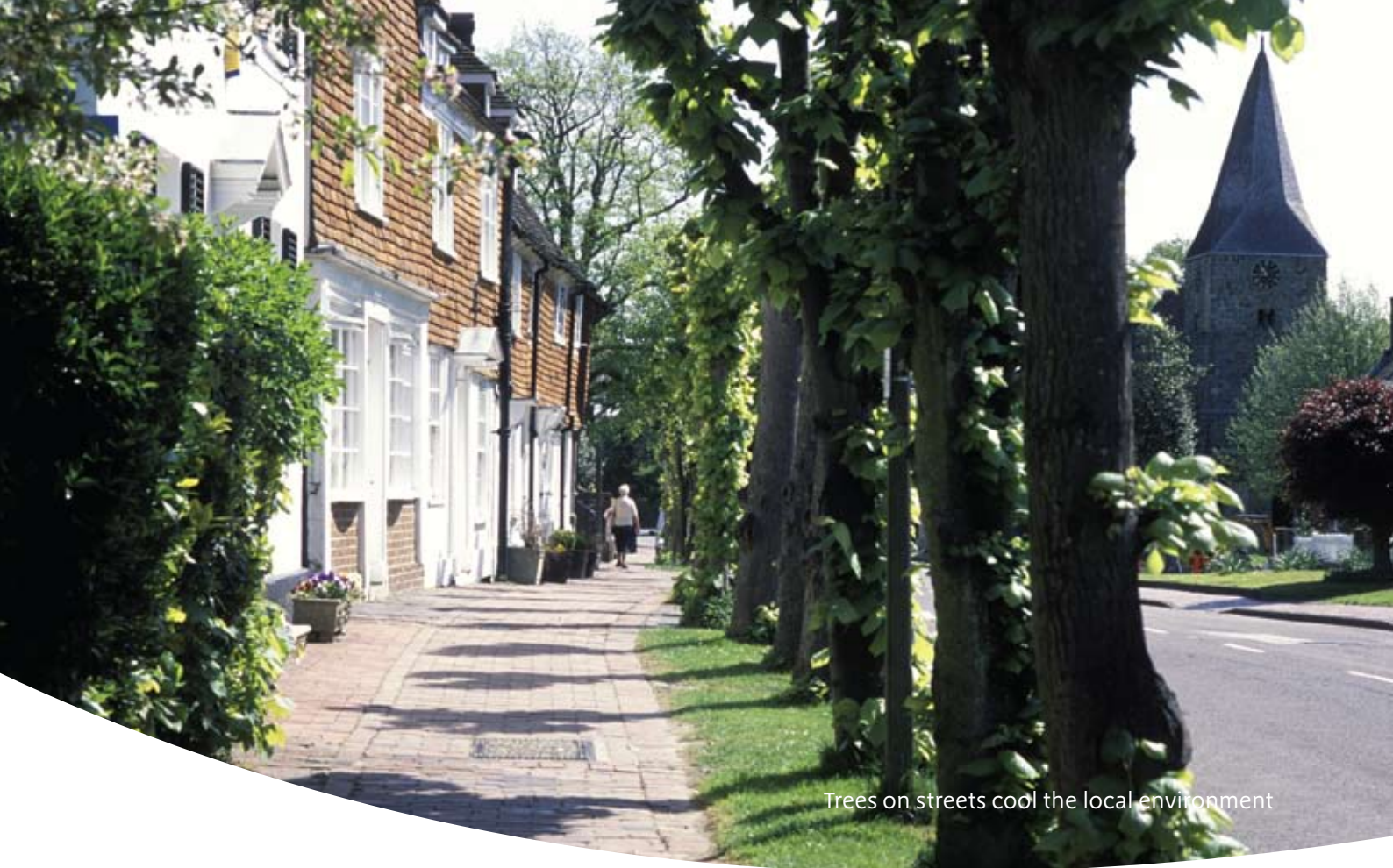
Trees on streets cool the local environment

Grasslands are extensive and because of this they store more carbon than any other land use in England (686 million tonnes), with arable land the second largest store (583 million tonnes) (Bradley and others, 2005). Overall, grassland and cropland management in the UK was a net source of 6.87 million tonnes of carbon dioxide in 2005, which is over 1 per cent of total UK carbon dioxide omissions (UK Greenhouse Gas Inventory, 2008).