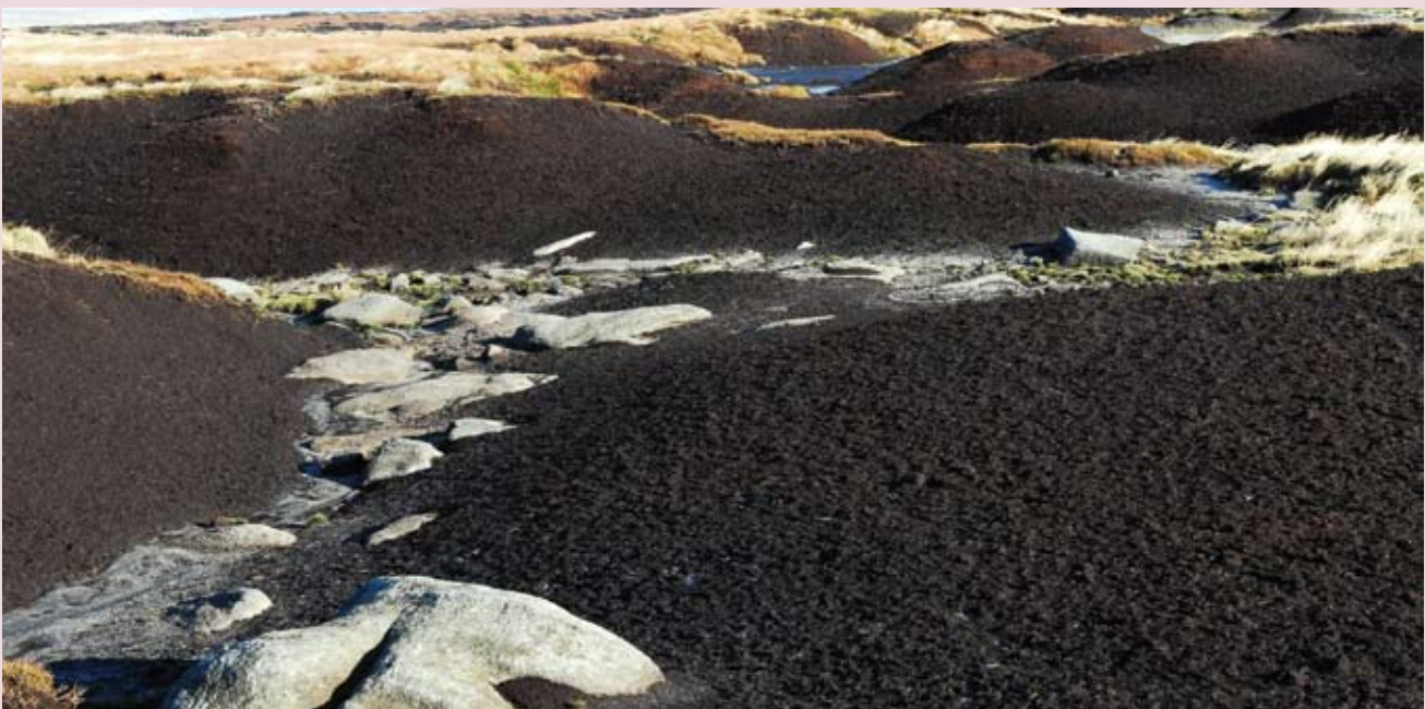
An un-restored area on Bleaklow