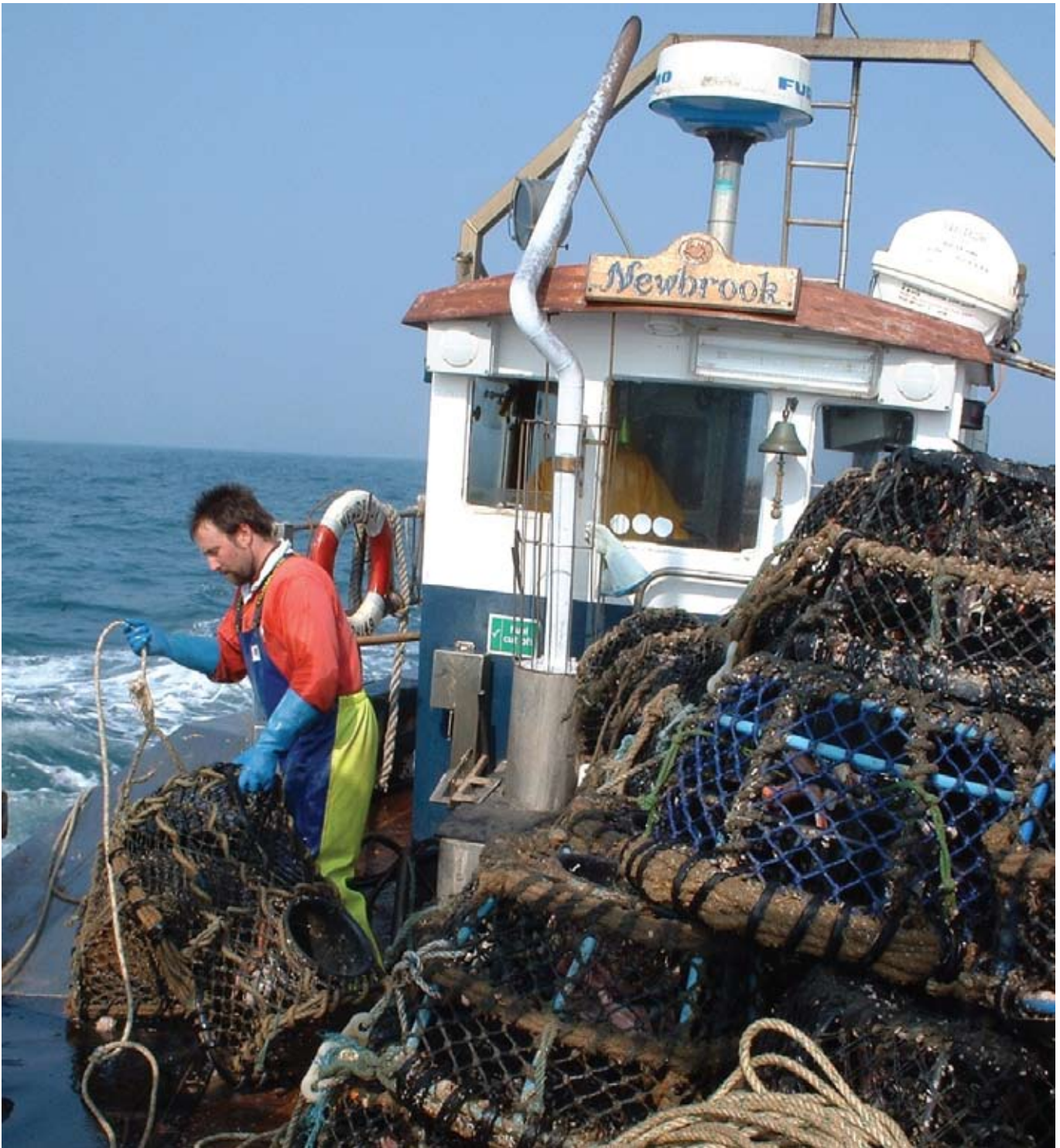
Crab fishermen shooting away a string of inkwell pots

Fishing is another industry that receives significant public support, much of which is still aimed at fleet modernisation and boosting capacity. This is despite 88 per cent of European Community stocks being fished beyond their maximum sustainable yield and 30 per cent being outside of safe biological limits (EC, 2009). The European Commission has recently concluded that the Common Fisheries Policy (CFP) – the framework that