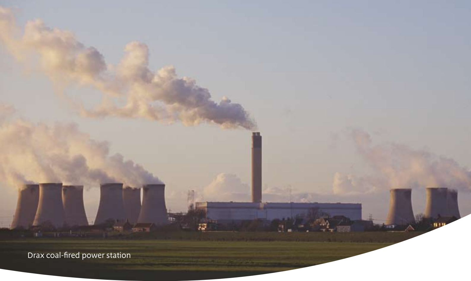
Drax coal-fired power station