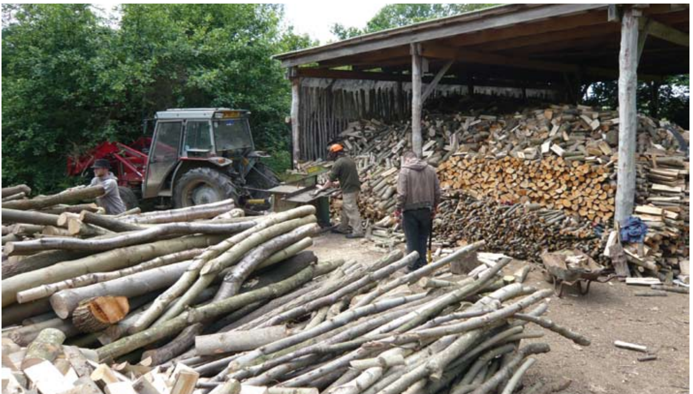
Logs for woodfuel

Wood has the potential to be used as a renewable carbon neutral fuel and the Forestry Commission Woodfuel Strategy aims to increase woodfuel harvesting to substitute for 0.4 million tonnes of carbon per year from fossil fuels (FC, 2007). It can also replace materials such as iron, steel and concrete, the production of which involves high fossil fuel use; timber use in house construction could reduce carbon emissions by up to 73 per cent (FC, 2006).