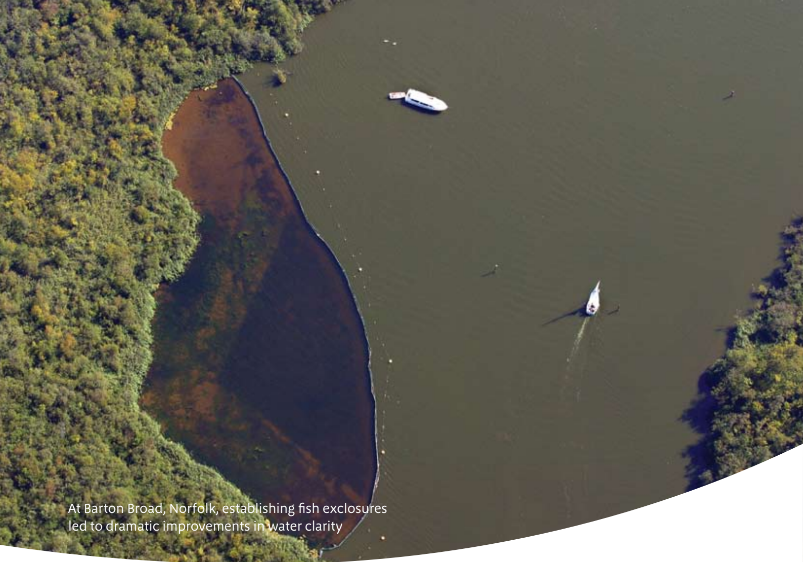
At Barton Broad, Norfolk, establishing fish exclosures led to dramatic improvements in water clarity