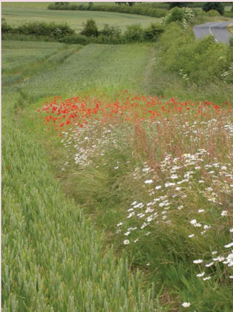
Conservation edge to an arable field

The evidence suggests that, on the whole, these schemes make a vital contribution to environmental outcomes in England (see forthcoming Natural England publication Agri-environment schemes in England ). Given the current limited set of policy levers available, agri-environment schemes are likely, for the foreseeable future, to continue to be the only mechanism for rewarding those who deliver a wide range of ecosystem services from the farmed environment. Continued investment is therefore vital.